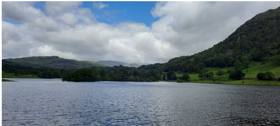
Grasmere, with thanks to Lol Wood.

Do you have a photograph of a Cumbrian landscape from your local area to share? Please send it to admin@ctic.uk for it to be included in a future edition of the newsletter. Thank you in advance.